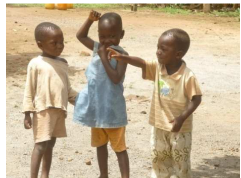
Children in Dangme West pointing at a butterfly