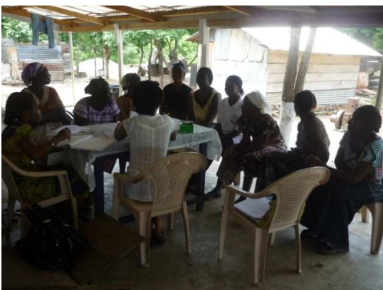
Focus group with women in a farming community

The Mobile Technologies for Community Health or MoTECH project, funded by the Bill and Melinda Gates Foundation, will investigate the question, "Can the adaptation of low-cost, mobile phone-based health technology address major gaps in knowledge and information-sharing among health care workers at the community and district levels?" MoTECH, with a special focus on the use of mobile technologies for maternal and newborn health, is a collaboration between the Columbia University Mailman School of Public Health and the Grameen Foundation. The project will also develop, test, and disseminate mobile phone-based applications designed to be used by people living in rural communities to answer questions they have about their most pressing health issues. This aspect of the project will investigate the question, "Can mobile phones be utilized to meaningfully answer questions and provide information to individuals in a way that promotes better health practices?" The project will build upon the momentum that has been created through the promising health care reform efforts to date in Ghana; set the stage for the completion of such efforts; and test whether promising technology can strengthen the community-based health care services that are increasingly being implemented throughout the developing world.