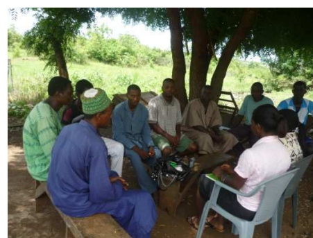
Focus group with men in a farming community